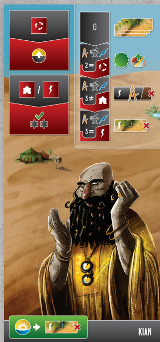
12 Character Boards