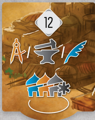
1 Laboratory Tile