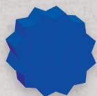
1 Sponsorship Marker